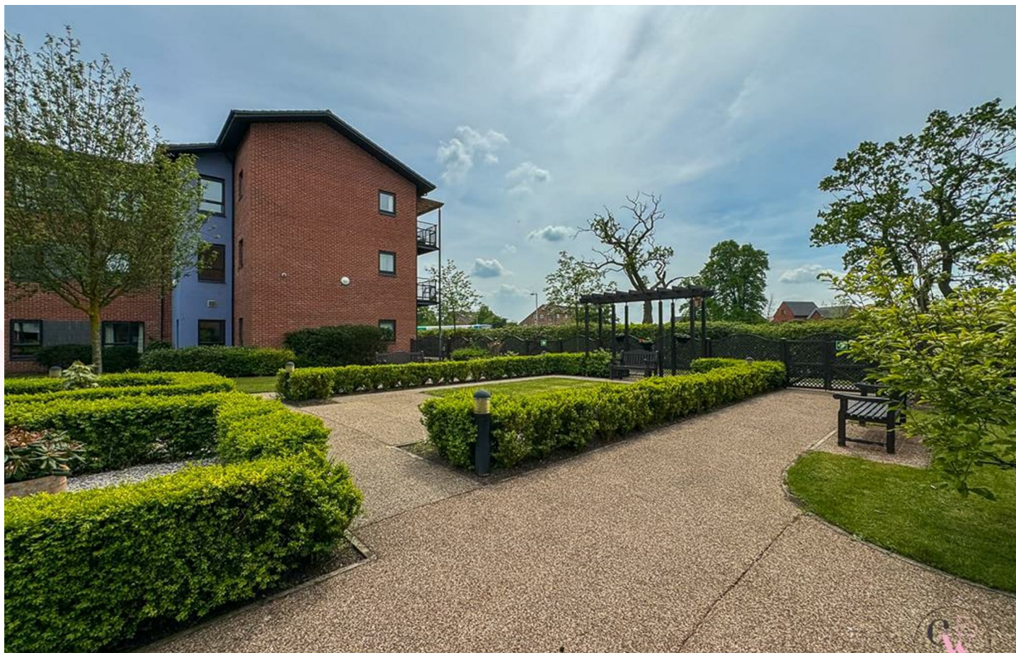
Hazelmere, Hambleton Way, Winsford CW7 1TN